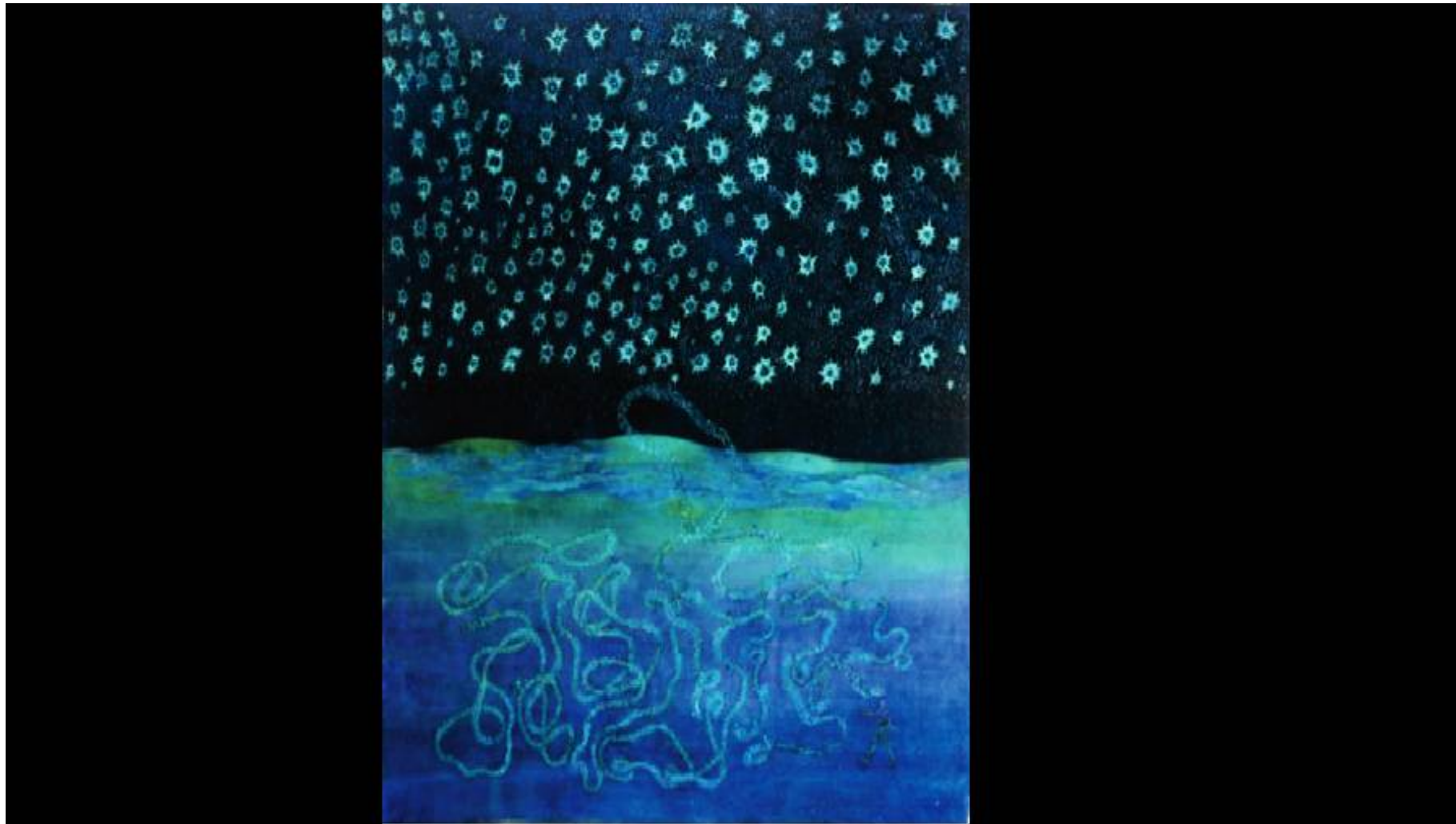
The Seeker by Varunika Saraf Chemould Prescott Road

Rita Datta | Published 08.01.22, 12:13 AM