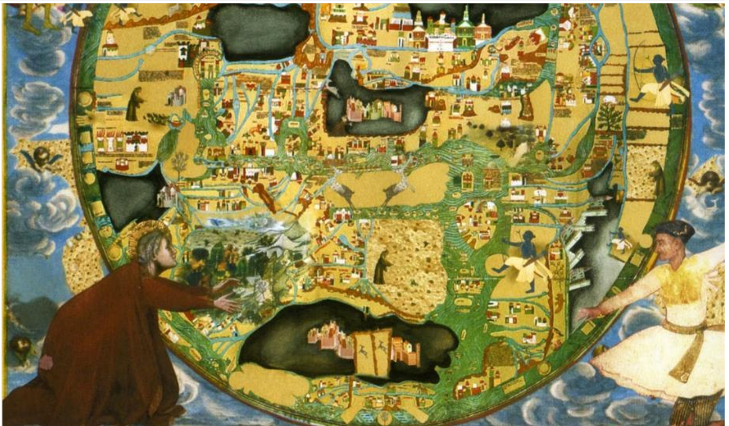
Gulammohammed Sheikh, The Mappamundi Suite 7, digital collage, gouache on inkjet

Soma Das (http://www.hindustantimes.com/columns/soma-das) Hindustan Times