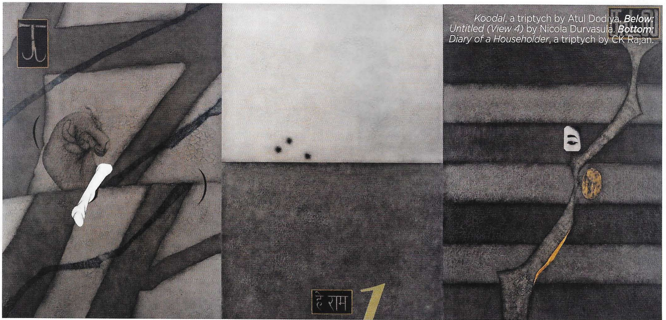
Koodal, a triptych by Atul Dodiya. Below: Untitled (View 4) by Nicola Durvasula. Bottom: Diary of a Householder, a triptych by CK Rajan.