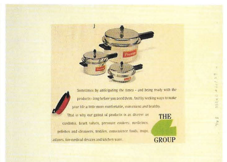
Sometimes by anticipating the times - and being ready with the products - long before you need them. And by seeking ways to make your life a little more comfortable, convenient and healthy. That is why our gamut of products is as diverse as cooktops, smart valves, pressure cookers, microwaves, pelleters and cleaners, textiles, convenience foods, innovations, bio-medical devices and kitchen ware. THE GROUP